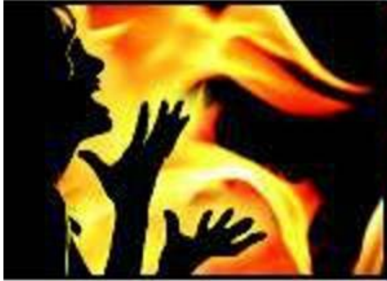
The fire broke out around 3.14am at the factory located in Begampur in west Delhi.

NEW DELHI: Four children were among five people of a family who died due to suffocation as a fire broke out at a small, paper-plate making unit on Monday morning.